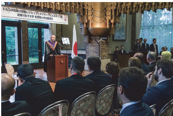
Commemorative speech by President Erdogan