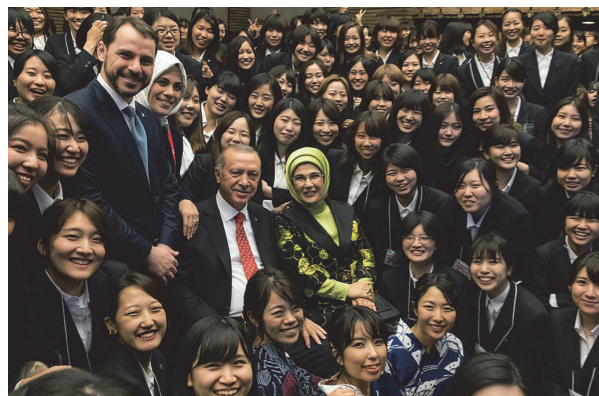
Communication of President Erdogan and the first lady with the students of the Department of Architecture and the Architecture Major