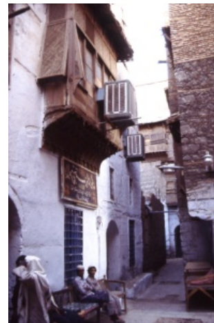
Fig 22. Traditional Settlement in Madinah-Saudi Arabia

Jeddah is a port city on the coast of Red Sea with hot humid climate. Being surrounded by city walls which remained intact until 1947 caused to scarcity of available building land. Jeddah houses have less shared walls and more exposed surfaces, compared to Makkah, in order to admit the maximum amount of wind from the Red Sea, so as to cope with extreme humidity with the help of passive ventilation systems.