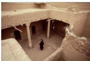
Fig 24. A Courtyard House in Dirijah, Near Rijadh-Saudi Arabia