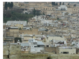
Fig 5. Traditional Settlement-In Fez / Morocco

Another quotation to explain the complexity of traditional built environment, in connection to traditional Muslim cities is as follows: