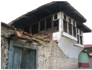
Fig 12. ‘Çıkma’, Open ‘Sofa’ and Door to ‘Avlu’- Court / A House in Kula-West Turkey

The living quarters are situated well above the ground level with two distinctly differentiated façade treatments. The one, which one may call the external façade is enriched with overhangs-‘ çıkma ’, and overlooks the street. The other façade giving onto the court-“ avlu ” is completely open and can be called as interior façade (Figure 12, 13).