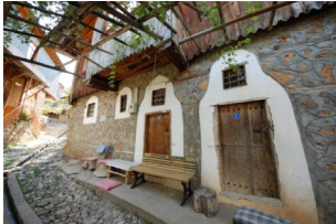
Fig 18. Traditional Street Pattern, Kemaliye

Hejaz settlements consist of multistoried houses, positioned in a densely built compact pattern with irregular streets. The number of storeys varies between four to six. The houses have thick stone walls, quarried from the bottom of Red Sea. In sharp contrast with courtyard houses, Hejaz, have extroverted indoor spaces through large window openings. The houses windows are covered with highly elaborate wooden surface covering elements called "mashrabiya". Windows in Hejaz have open, openable and closed parts. Having several layers and displaying highly artistic and ornamental features. The wooden claddings do not have glass surfaces to allow the maximum benefit from the wind. The wooden elements are so cleverly designed and implemented that the house inhabitants can see the outdoors without being seen. Moreover, they lend themselves suitable to look downwards and upwards (Eyüce, 1985).