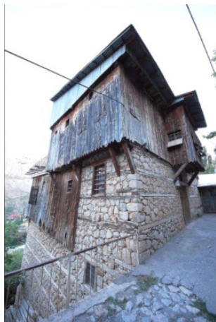
Fig 30. Traditional House in Kemaliye

The settlements utilizing the surface of the earth as the basic building material and carving the method of building production, the interdependence, though each settlement has its own specificities, is largely and outcome of the necessity to comply with the cultural norms and also to be in harmony with natural surroundings (Figure 31).