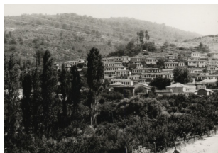
Fig 7. Traditional Settlement in West Turkey-Şirince

One discernible aspect of this long lasting building tradition is the realization of settlements on the slope. This unwritten building tradition has produced its own saying which can be translated into English as: ‘Land aback, plain afore’, with very few exceptions, majority of Ottoman settlements have been realized on hilly sides for not only defensive purposes but also to make space for agriculture on the plain (Figure 7).