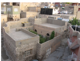
Fig 25. A Courtyard House in Mardin-Turkey

It has been mentioned in the preceding parts of this study that despite the fact that all traditional buildings are in harmony with nature and although different cultures have their own approaches to cope with the impact of natural forces. There are numerous examples of different cultures settled in the same geographical region and shaping their built form on their own way. Therefore courtyard houses are as components of settlements are assembled in varying degrees of compactness depending on the cultural interpretation of natural environmental factors. Chinese quarters in Malaysia with traditional row houses is one such case, in that, traditional Maley houses in the same region and under the impact of some natural factor have evolved according completely different principles of shaping. Traditional Maley houses are detached buildings and are elevated from the ground on stilts, whereas the Chinese house are constructed on the street level and have shops on the ground floor (Figure 26).