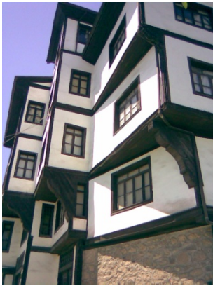
Fig 13. ‘Çıkma’-Beypazarı

“ Çıkma ”, the protrusion from the main body of the building plays so important a role in the spatial syntax of both the house and the whole settlement that without mentioning its importance none of the analytical studies will be complete. It is not only an extension of indoor space toward the outdoors but also it provides the interior space with a full length view of the street. If the house is a corner building the two streets on both side of the corner become visually accessible (Figure 14, 15, 16).