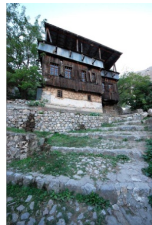
Fig 10. Traditional Settlement from East Turkey-Kemaliye

Traditional Ottoman settlements consist of irregular street patterns whereas the first floor plan organization, which is the main living floor, consists of square or nearly square rooms. Cerasi explains this formation in traditional settlements as follows: “...patterns are open and allow the house to be composed as an agglutination of preconceived and geometrically regular rooms (Cerasi, 1998) (Figure 10, 11).