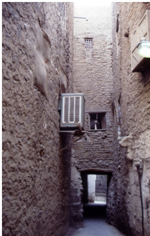
Fig 23. Street Pattern in Traditional Madinah

Courtyard as an organizing element of spatial syntax of the house is the privatization of an open space totally under the control of the house inhabitants: it provides a clear spatial division of public and private domains. As an element of climate control it functions as a regulator of heat loss. Çatalhöyük and Aslantepe are early settlements located in Turkey. These two settlement are assemblies of courtyard houses with no streets among the houses at all. The access to each individual house is provided through the roofs. The compactness of the settlement to the extent of unifications must have been dictated by defense requirements (Figure 23, 24, 25).