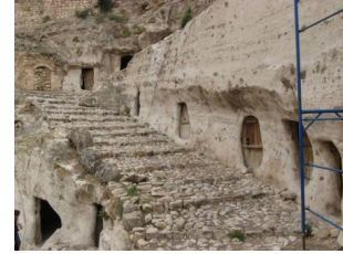
Fig 31. Settlement Where Carving Utilized as the Fundamental Building Production Method-Hasankeyf

The settlements utilizing the surface of the earth as the basic building material and carving the method of building production, the interdependence, though each settlement has its own specificities, is largely and outcome of the necessity to comply with the cultural norms and also to be in harmony with natural surroundings (Figure 31).