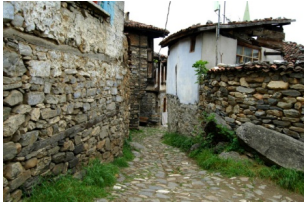
Fig 17. Traditional Street Pattern, Cumalikızık

the privacy of the indoors. 'Kharjas' positioned at different levels display a roof scape peculiar to Hejaz (Figure 17, 18).