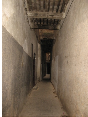
Fig 6. Passenge Way between Houses-Fez, Morocco

they evolve in line with the accumulated and handed down building tradition emanating from cultural and natural factors. During this process of evolution house-to-house relations among the individual dwelling units play a major role. The function of each unit is not only to provide the necessary shelter so as to fulfill the spatial needs of its occupant but also to be an integral component of the whole settlement and help shape communal spaces (Figure 6).