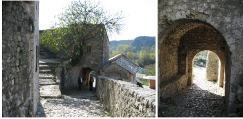
Fig 1, 2. Pocitelj Traditional Settlement in Bosnia

The theoretical, construct of this study is therefore, based on the premise that the shaping of traditional built form, which includes both the house and the settlement simultaneously, is the product of a co-influence which gives way for the co-existence of the two. In other words the end product of traditional building and the object of the research in this field is the traditional built environment in all its entirety.