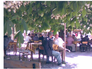
Fig 16. Coffee House in the Public Space