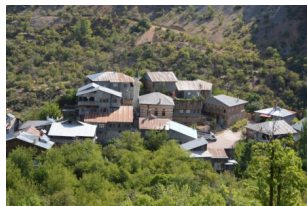
Fig 29. Traditional Settlement Pattern-Kemaliye

The main concern of the study is the interdependence between the morphological properties of the individual living unit and the pattern of settlement in traditional built environments. This interdependence, which reflects itself on the built form at varying degrees depending on the natural constraints and the specific requirements of different cultures reaches, in some cases, to the extent of an unavoidable coexistence of the integral components of traditional settlements. There are even cases that, like for instance the entirety of the settlement functions as if it has been conceived as a single building mass (Figure 29, 30).