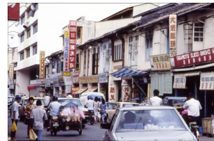
Fig 26. Shop Houses with Courtyard in Melaka-Malaysia

It has been mentioned in the preceding parts of this study that despite the fact that all traditional buildings are in harmony with nature and although different cultures have their own approaches to cope with the impact of natural forces. There are numerous examples of different cultures settled in the same geographical region and shaping their built form on their own way. Therefore courtyard houses are as components of settlements are assembled in varying degrees of compactness depending on the cultural interpretation of natural environmental factors. Chinese quarters in Malaysia with traditional row houses is one such case, in that, traditional Maley houses in the same region and under the impact of some natural factor have evolved according completely different principles of shaping. Traditional Maley houses are detached buildings and are elevated from the ground on stilts, whereas the Chinese house are constructed on the street level and have shops on the ground floor (Figure 26).