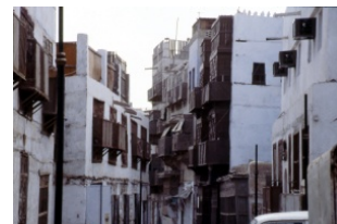
Fig 21. Traditional Settlement in Jeddah