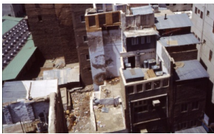
Fig 19. Roofscape with 'Khanjas' in Jeddah

Compactness of settlements is the general property which holds true for all Hejaz cities. It is climatically appropriate and also bears relevance with cultural necessities. Nevertheless there are discernible settlement pattern differentiations among various cities emanating from the peculiarities of each city. Jeddah, Makkah, Madinah, Yanbu and Taif are the main cities of the region. In this study Jeddah and Makkah will be dealt with for a comparative analysis (Figure 19, 20, 21, 22).