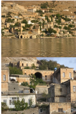
Fig 3, 4. Traditional Settlement in South East Turkey-Halfeti

In connection with the aforementioned contention concerning the traditional building and particularly about traditions Charpentier's view is as follows: "traditions in this context means a way of organizing spaces from the scale of the house to the scale of the village and the town using models and practices which are legacy of the past" (Charpentier, 1989) (Figure 3, 4).