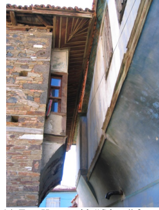
Fig 14. Two House with “Çıkma” from Kula

“ Çıkma ”, the protrusion from the main body of the building plays so important a role in the spatial syntax of both the house and the whole settlement that without mentioning its importance none of the analytical studies will be complete. It is not only an extension of indoor space toward the outdoors but also it provides the interior space with a full length view of the street. If the house is a corner building the two streets on both side of the corner become visually accessible (Figure 14, 15, 16).