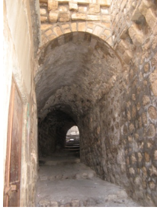
Fig 28. 'Abbara' in Mardin

The case of Mardin constitutes the perfect example of evaluation of a settlement fabric with its solids and voids.