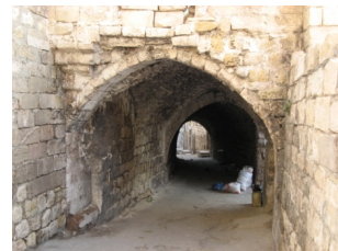
Fig 27. 'Abbara' in Mardin

The settlement consists of houses with not only shared walls but also with shared slabs at several levels. The street pattern which is partly opened partly covered has so evolved that its continuity is provided with vaulted passage ways realized underneath the living quarters of the dwelling units. The vaulted passage ways are locally called 'abbara' (Figure 27, 28).