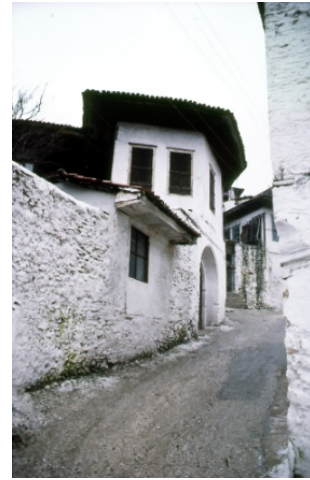
Fig 15. A House from Muğla with high count walls