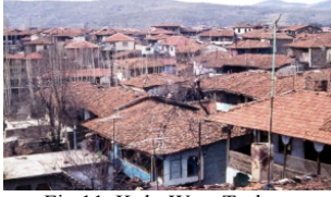
Fig 11. Kula-West Turkey

The ground floor at street level, which is reserved for ancillary utilizations like storage, is surrounded by high and windowless walls to secure complete isolation from the public space. These high periphery walls abide by the irregularities of both the site and also the ownership lines. In other words the ground floor morphology is not necessarily a projection of the regularly organized living level plan.