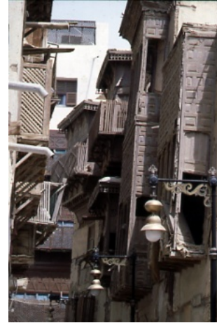
Fig 20. Proximity and Separation of Houses in Jeddah