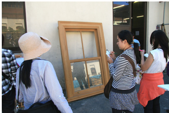
Measuring and making sketches of a window frame at Dolmabahçe Palace