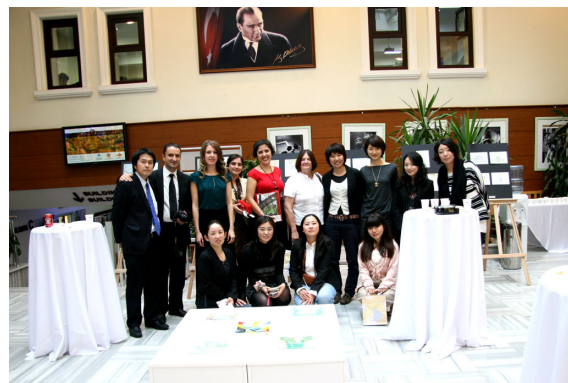
After the sketch exhibition