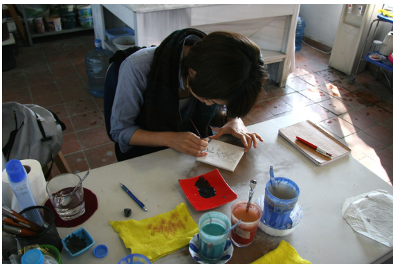
Students experiencing Iznik tile painting

We had a course at a municipal department KUDEB, which engages in conservation and repair of wooden house, cami, bridge and rampart which do not belong to the palace. It has a basic stance to respect original parts or design as much as possible. After the briefing of KUDEB with DVD and slides, we were taken to the laboratory to observe and try renovation of wooden fixture. We experienced a shave using Turkish plane as well as the filling of worm holes on the door that date back about 200 years ago. We were also taken to a site of restoration by an architect in charge where a 19 th century wooden house with a shop was being repaired. When renovated, it will be used as the library. Then we visited Süleymanyne Camii designed by Mimar Sinan to observe and sketch it.