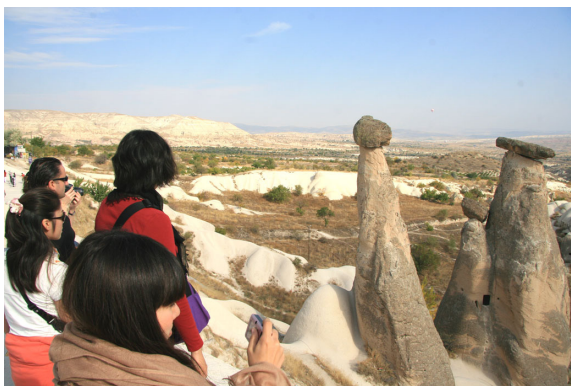
View of the three mushroom-shaped rocks in Ürgüp