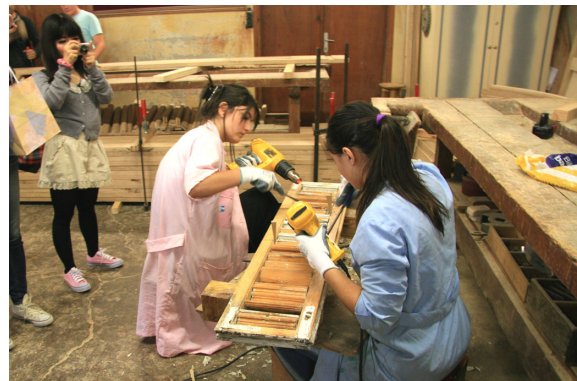
Architectural atelier at Yildiz Palace Removing paint