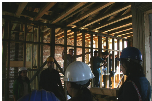
Wooden structure being refurbished, the hall on the second floor