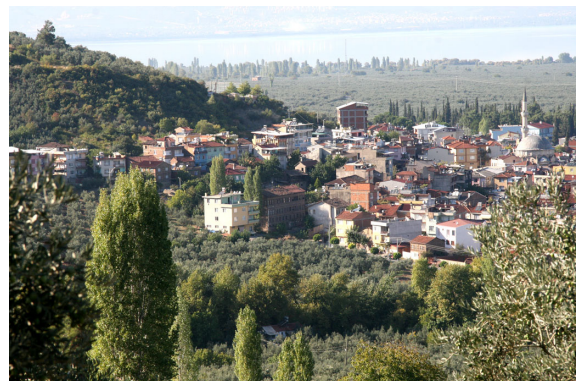
The town of Sölöz as seen from the height