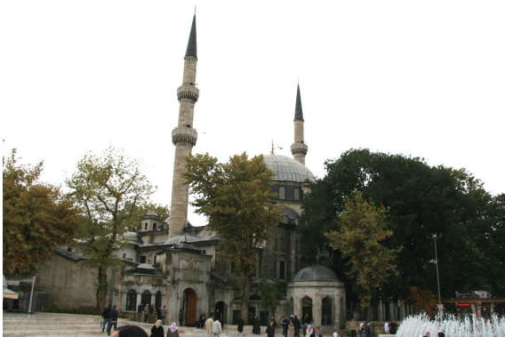
Outside view of Eyüp Sultan Camii

We set up the sketch exhibition scheduled for tomorrow. In meantime we visited Mimar Sinan University and attended a lecture on the life of Sinan. Also we visited the Institute of Japanese Culture studies and displayed a battledore which we donated this time.