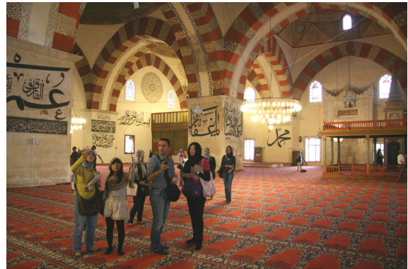
Inside view of Eski Camii (Old Mosque)