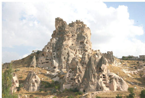
Observing Uçhisar at a short distance