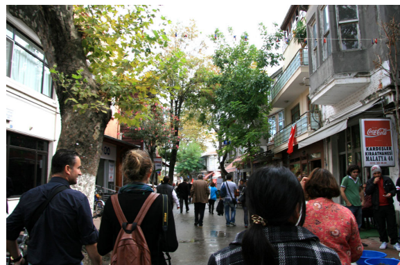
Street of Buyukada