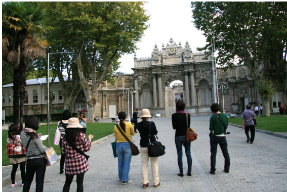
Students making sketches of the western gate of Dolmabahce Palace

We visited Büyükada Island situated to the south of Istanbul in a distance of one and a half hour by ferry to observe a large scale wooden structure and wooden houses. In the morning, we visited Greek Orphanage, which is said to be the largest of the wooden building in Turkey. The building was originally designed and constructed in 1888 as a hotel, and yet, it had been used as orphanage until 1960s because the use as a hotel was not granted. In the afternoon, we visited the city hall of Adalar upon request of head of mayor's secretary, where we took ceremonial pictures with deputy mayor and exchanged with the head of secretary. Then, we visited a wooden house which seemed to have been influenced by the idea of Japanese architecture and made sketches of it.