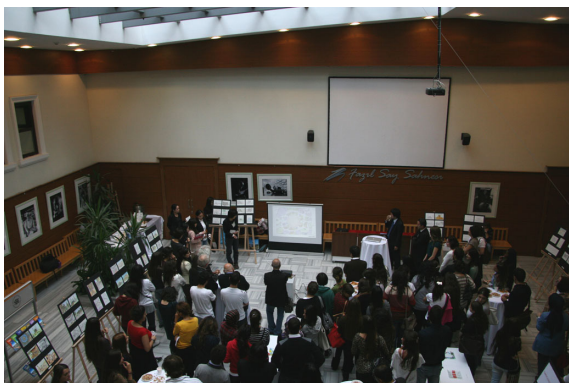
The sketch exhibition at Bahcesehir University