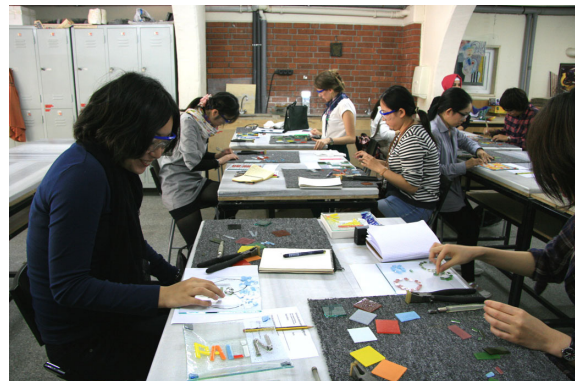
Students making glass sculptures using a technique called fuzyon