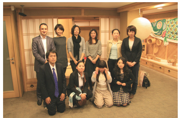
Visiting the Institute of Japanese Culture studies