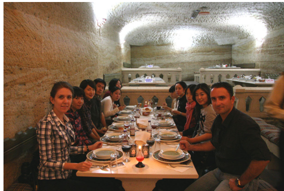
Having lunch at a cave restaurant