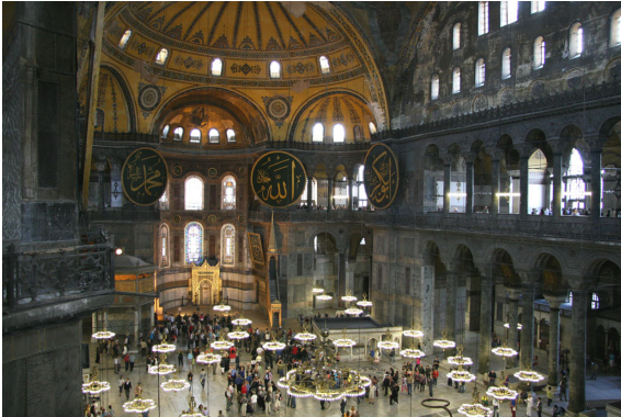
Inside view of Hagia Sophia

We visited Edirne situated close to the borders with Greece and Bulgaria. Edirne is said to have originated in a town constructed by Emperor Hadrian. The town, which was called Adrianopolis or Adrianople, was once the capital of Ottoman Empire for a certain period. We visited Selimiye Camii designed by that great Ottoman architect Sinan, which Sinan himself values as his own magnum opus, as well as Eski Camii (Edirne's oldest Camii), Uç Serefeli Mosque whose four minarets are all different in form each other and Edirne Medical Museum Beyazıt II which is characterized by its space for music therapy.