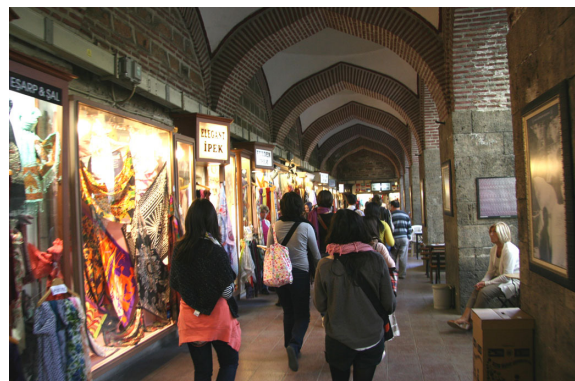
Koza Han: A caravansary built in 1490 The name Koza (cocoon) Han derives from then flourishing cocoon trade. In