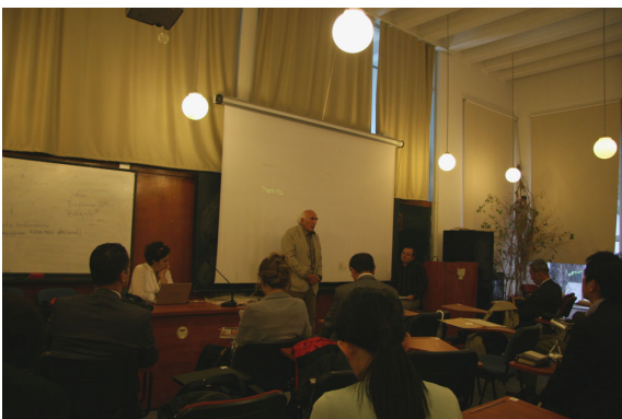
Listening to a lecture on the life of Bruno Taut