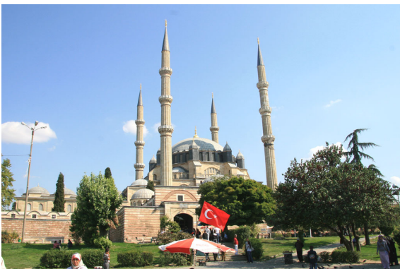
Selimiye Mosque designed by architect Mimar Sinan in the late 16th century and considered by himself to be his masterpiece