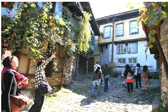
Cumalikizik: Jutted upper story was devised so as the muslimahs (Muslim women), who were not allowed to go out, could have better views of the street