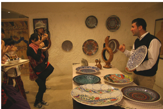
Listening to an explanation of technique of pottery at a bottega in Avanos

The second day in Cappadocia. In the morning we visited various places: Ürgüp, famous with mushroom rocks in a set of three; Mustafapaşa, a town once inhabited by the Greek and now a town of mixed styles of houses from Roman period, Ottoman Empire as well as modern times; Kaymakli, the largest of the underground towns; and old towns of Göreme and Nevşehir built on the slopes. After lunch we continued to: Göreme panorama; a cave house still being inhabited; Uçhisar, the largest of the cave castles; and pigeon valley with nests of 500,000 pigeons. Then we returned to Istanbul by air.