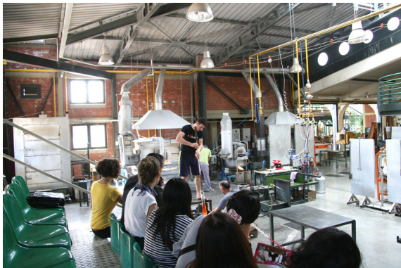
Visiting a glassblowing studio at the Glass Furnace

We visited Bursa, the first capital of Ottoman Empire. To begin with we observed Cumalikizik, a traditional settlement with 700 years' history. This colony has come to attract attention in the recent ten years. We enjoyed walking and sketching maze of streets characterized by the lined-up houses with Cumba, a structure with the second and/or the third story jutting out over the street. Then we moved to downtown Bursa to visit Ulu Camii, a building contemporary with Eski Camii at Edirne, Koza Hanı, which has a popular café in the courtyard, and, Yeşil Türbe (green tomb) in which the body of Mehmed I rests. Then, we left Bursa for Iznik to stay at the guest house of Iznik foundation Tiles.