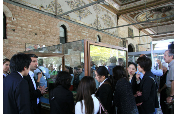
Students receiving an explanation on Topkapi Palace