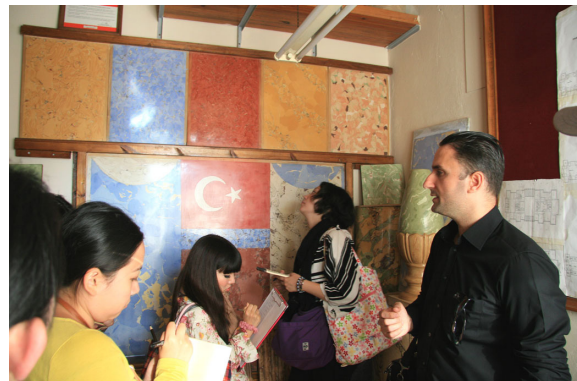
Atelier of stucco at Dolmabahce Palace