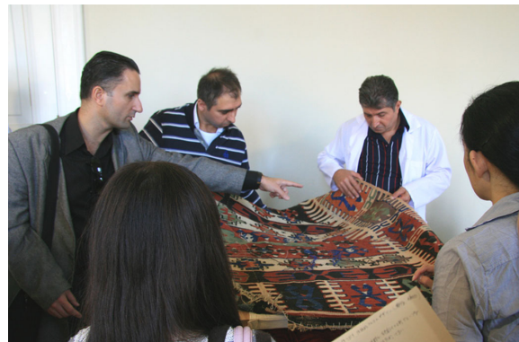
Textile atelier at Yildiz Palace