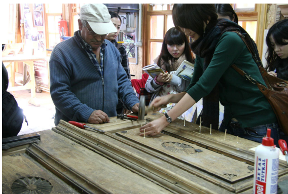
Working at the bottega: Students as working on the repair of worm holes on the door from 200 years ago