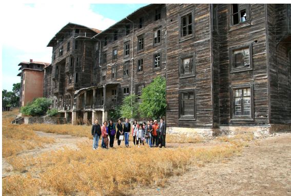
Photograph in front of Greek Orphanage