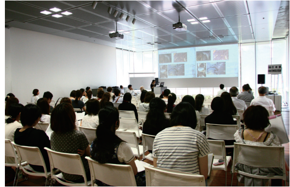
Session at Presentation Room in Architecture Studio