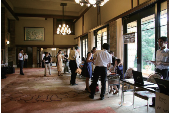
Registration desk in Koshien Hall