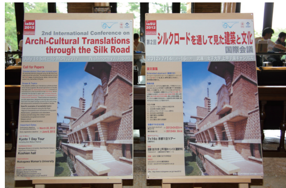
Posters of conference