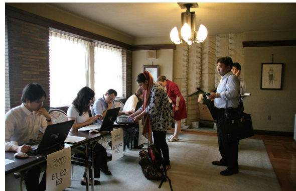
Registration desk for presentation data