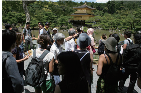
Kinkaku-ji (Course B)