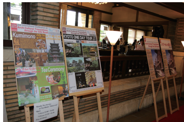
Posters of Kyoto one day tour, tea ceremony and Kumimono Demonstration