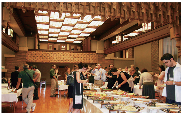
Dinner Party at West Hall in Koshien Hall