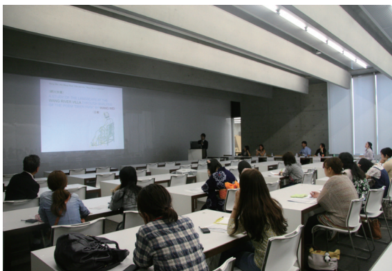
Session at East Studio in Architecture Studio