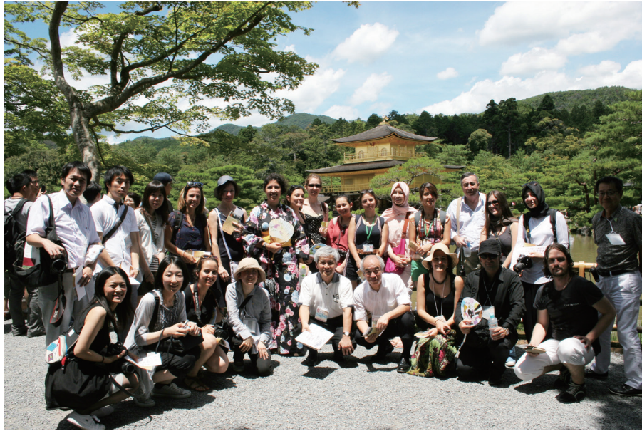
Commemorative photo in front of Kinkaku-ji (Course B)