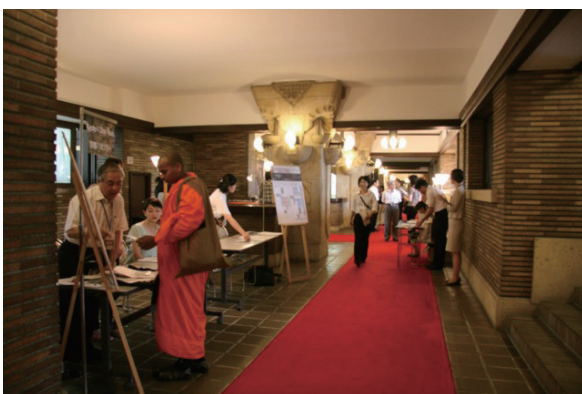
Registration desk for Kyoto One Day Tour