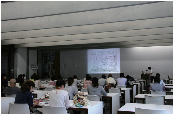
Session at East Studio in Architecture Studio