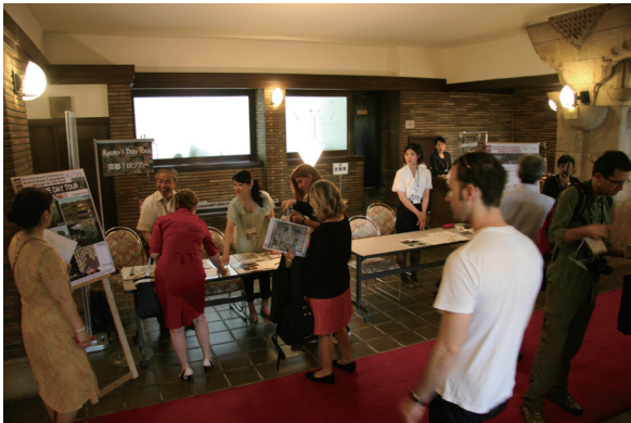
Registration desk for Kyoto One Day Tour