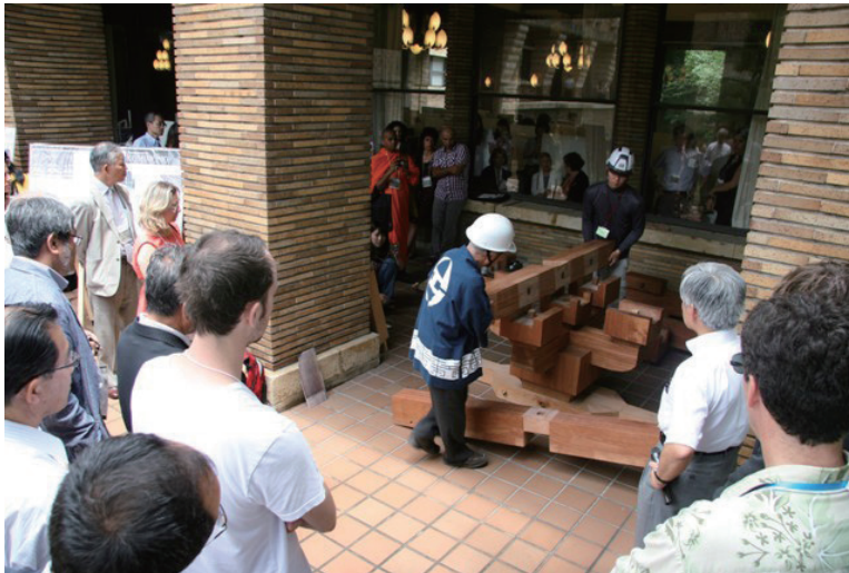
Kumimono Demonstration at the terrace in Koshien Hall