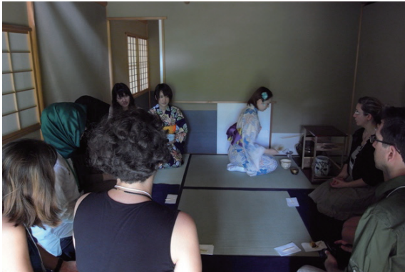
Tea ceremony at the teahouse "Jimyo-an" in the garden of Koshien Hall