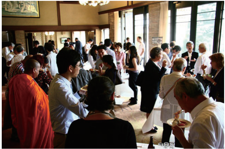
Welcome Reception at Lounge in Koshien Hall