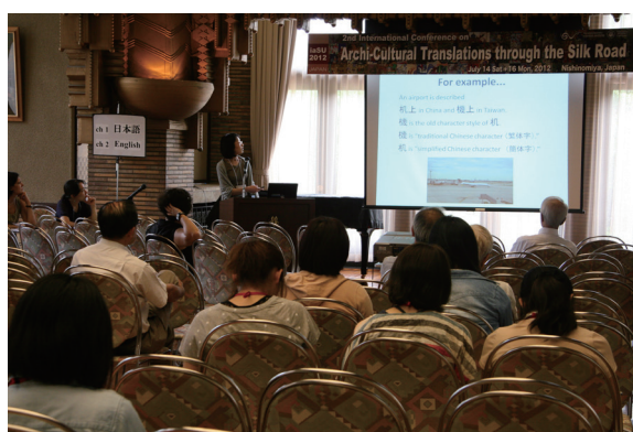
Session at West hall in Koshien Hall