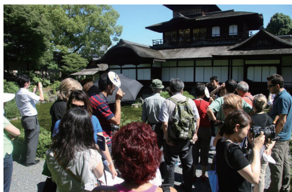
Hiunkaku in Nishihongan-ji (Course A)