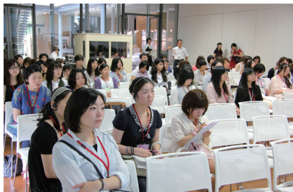
Session at Presentation Room in Architecture Studio