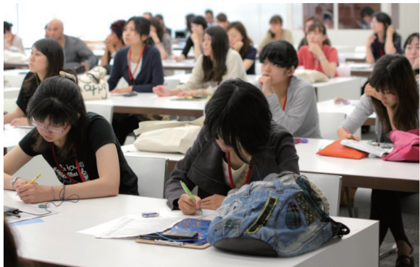
Session at East Studio in Architecture Studio