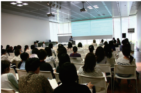
Session at Presentation Room in Architecture Studio