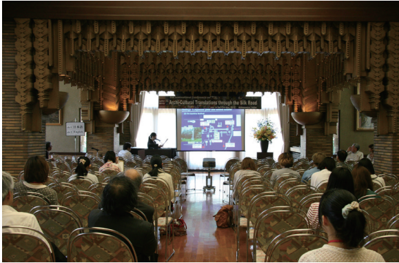
Session at West hall in Koshien Hall

On the second day, sessions on “Regional characteristics and individuality of living space,” “Science and technology that underpin culture,” “Sustainability and global environment,” “Religion and art” and “Case studies on cultural formation,” which had 18 and 16 presentations in the morning and in the afternoon, respectively, were held at the three venues, i.e. West Hall in Koshien Hall, Presentation Room and East Studio in Architecture Studio.