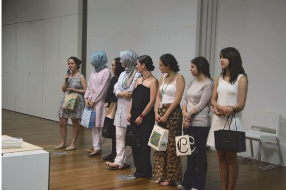
Thanking MWU students.

After the jury, we had a farewell party for BU students. The third-year students at MWU, who had studied in the same studio for a month with the BU students, gave them presents. After that, each expressed their gratitude to the MWU students, and a commemorative photo was taken.