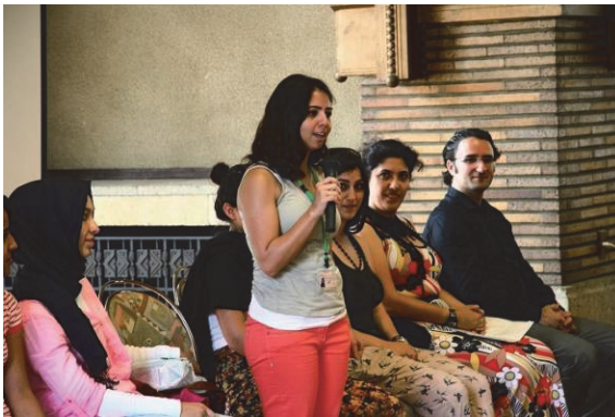
Self introductions by BU students.