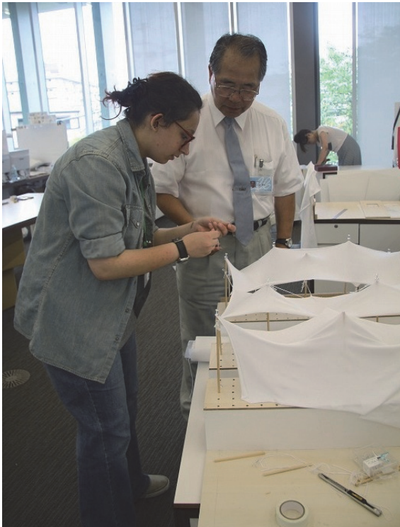
Studying before inter-jury