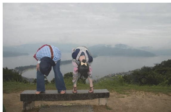
When the sky and the earth are viewed upside down, Amanohashidate resembles a bridge across the sky