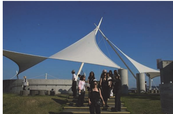
Visiting the Rest House on Okura Beach in Akashi