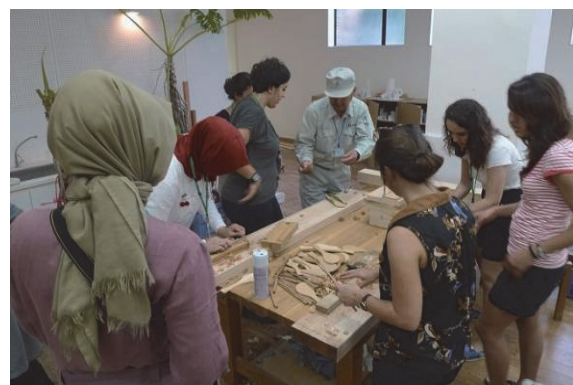
BU students made rice paddles and chopsticks.