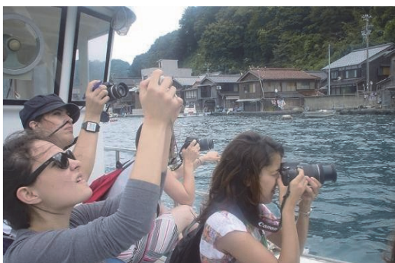
Funaya from marine taxi

The students visited Ine and Amanohashidate with MWU third-year and fourth-year students and saw Funaya (houses with unique boat garages) in Ine from the sea and land. After that, they moved to Amanohashidate which is one of Japan's three most famous scenic places. They went to Kasamatsu Park by cable car and experienced the fantastic misty view with the sea spray.