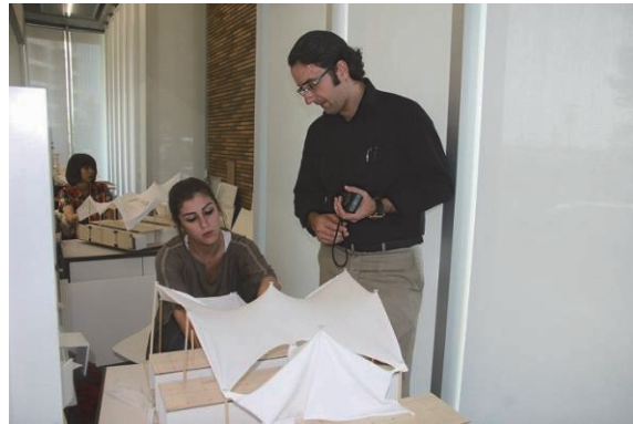
Conversation with teacher