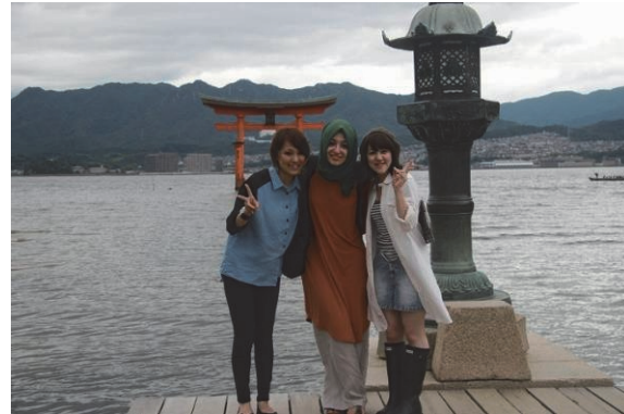
BU and MWU students strengthened their friendship.