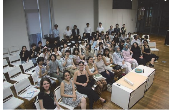
Photo after farewell party