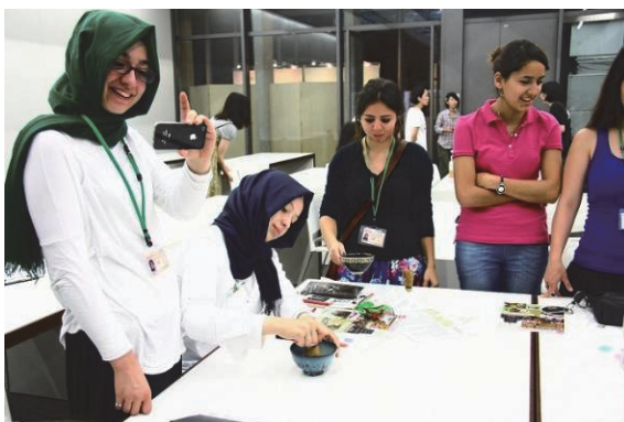
Tea Ceremony lesson

Before the conference, the students experienced the Tea Ceremony lesson with MWU students.