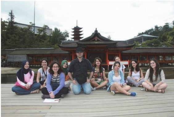
Photo taken on Hirabutai stage

The students visited Miyajima Island, which is another of Japan's three most famous scenic places with third-year and fourth-year students at MWU. After arriving by ferry, they walked to Itsukushima Shrine along a beachfront road and visited many buildings in the shrine and viewed the mountain range over the Otorii (the grand gate). They sketched the buildings, the waterscape, and the green landscape around the shrine.