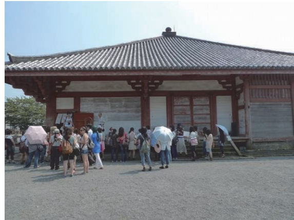
Visiting Jodo-do of Jodoji Temple