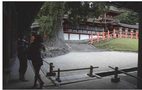
Visiting Kasuga-taisha Shrine