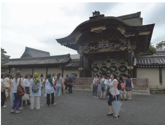
Visiting Karamon Gate at Nishi Honganji Temple

The students visited Nishi Honganji Temple with first-year MWU students. They went to Shiro-shoin, which is one great example of shoinzukuri, a traditional residential architectural style in Japan, and Hiunkaku, which is one of Kyoto's three great pavilions along with Kinkakuji and Ginkakuji Temples. They also saw the oldest Noh stage in Japan, Karesansui (a Japanese rock garden) in Shiro-shoin, and a beautiful garden that showed good communion with Hiunkaku.