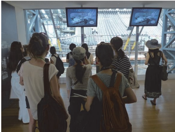
Visiting restoration and preservation work on Himeji Castle

The students visited Himeji Castle, which is being restored, and the Jodo-do of the Jodoji Temple, which is one of the few existing examples of Daibutsuyo style architecture, with first-year MWU students. At Himeji Castle, they observed the roofing and plastering work for the restoration and preservation from the roofed exhibition route. In the Jodo-do, they experienced the dynamic interior space of Daibutsuyo style architecture with the sunlight from behind the Buddha statues.