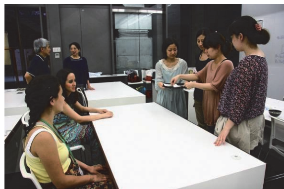
Tea Ceremony lesson