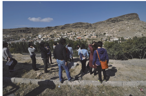
A view of villages of Göre: houses seem as if they were adhered to the mountain side.