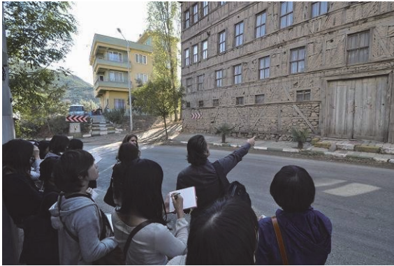
Four-storied wooden building in Sölöz