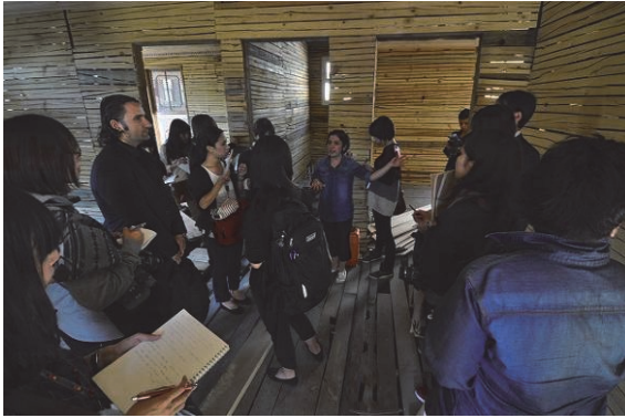
Wooden house under renovation by KUDEB