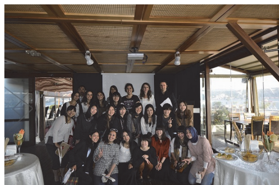
Photo after sketch exhibitions