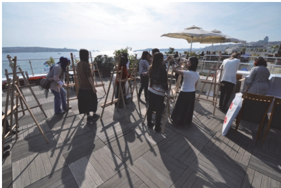
Setting up for the sketch exhibition