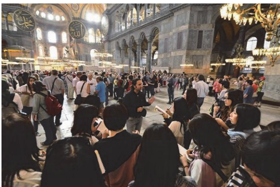
Hagia Sophia: former orthodox patriarchal basilica, later a mosque, and now a museum in Istanbul