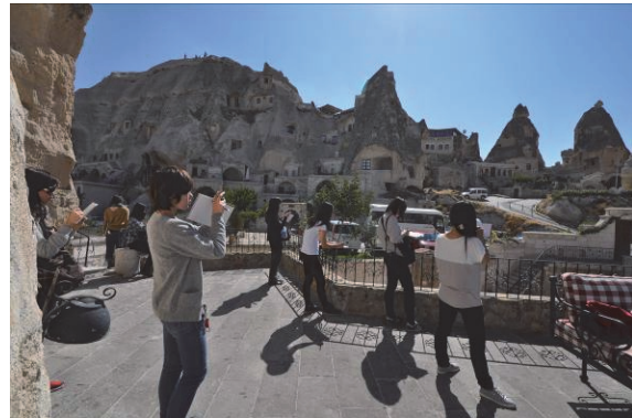
View from a cave hotel in Cappadocia