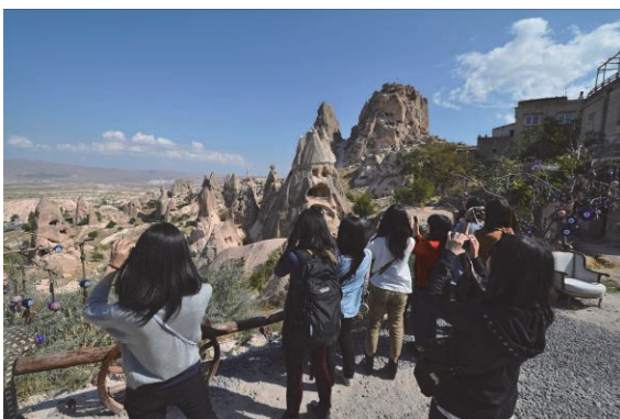
Uçhisar Castle in Cappadocia