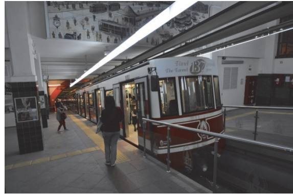
Taking the Tunel (subway)