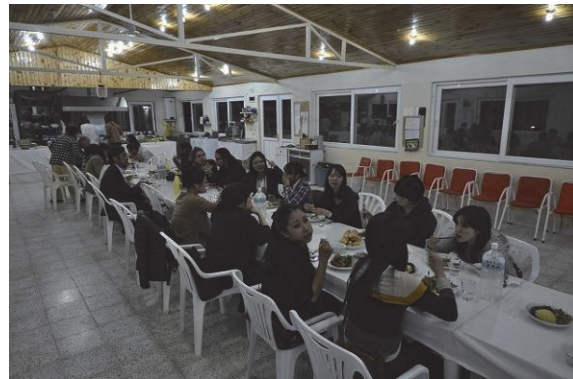
Dinner at JIAA