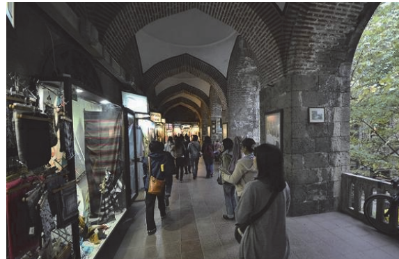
Koza Hanı: silk market with a courtyard