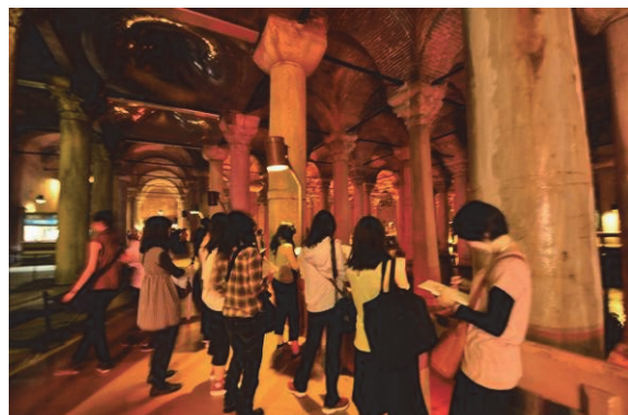
Basilica Cistern: largest of several hundred ancient cisterns beneath Istanbul