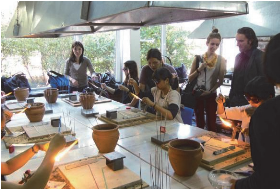
Students making glass beads