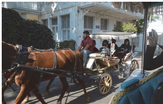
Riding horse and buggy on Büyükada Island.

We visited Büyükada Island, which is about 90 minutes south of Istanbul by ferry, to observe a large wooden structure and some wooden houses. We first went to the Greek Orphanage, which is reportedly the largest wooden building in Turkey. The building was originally designed and constructed in 1888 to be a hotel, and yet it was used as orphanage until the 1960s because it was not permitted to be a hotel. In the evening, we visited the Taksim Square and İstiklal Avenue and rode Tünel, the oldest underground railway in Europe, which started in 1875.