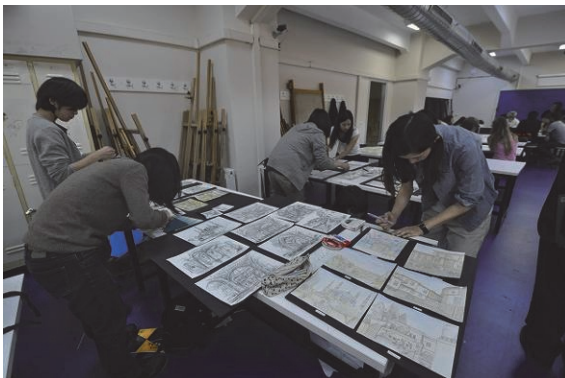
Students preparing sketch exhibitions

In the morning, we prepared a sketch exhibition for the following day in BU. In the afternoon, we went to Üsküdar on the Asian side to visit the Yeni Valide Mosque. Then we took a ferry to Eyüp on the European side and visited Pierre Loti Café. In the evening, we climbed the Galata Tower and visited İstiklal Avenue again for shopping.