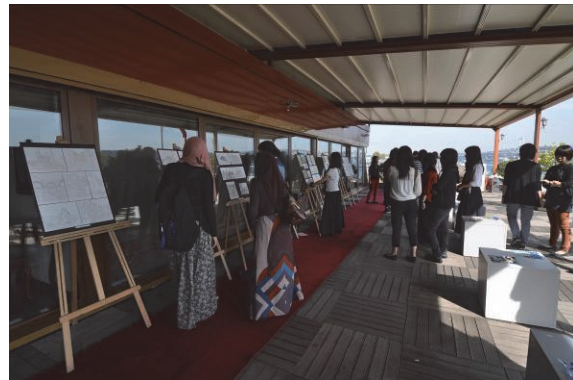
Sketch exhibition at BU