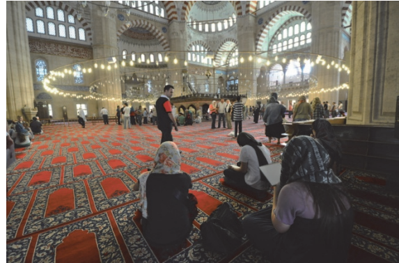
Sketching the interior view of Selimye Mosque