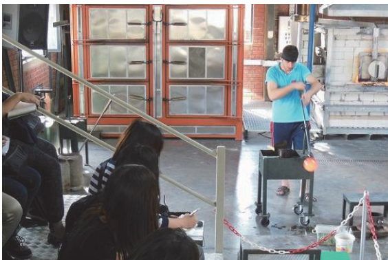
Glassblowing studio at Glass Furnace

We visited The Glass Furnace, which is a glass works atelier at Sile, in a suburb of Istanbul. After observing the atelier and the glass blowing process in the morning, we worked on glass beads in the afternoon. Then we moved to another room to create a glass piece with a technique called fuzyon, where pieces of colored glass of any shape are placed on a sheet of clear glass. Later, these works will be completed as objet d'art or plates of fused glass after being dried in the kiln at the glassworks. After that, we visited the showroom of the glassworks.