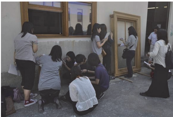
Students measuring and sketching a window