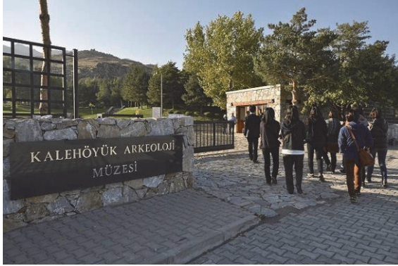
Museum of Archaeology at Kaman-Kalehöyük