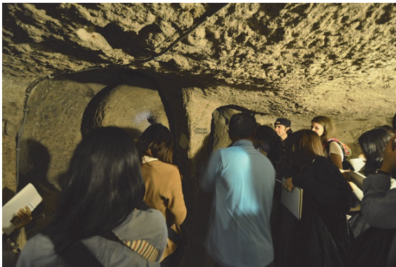
Kaymaklı (underground city): a shelter for persecuted Christians.

We visited Cappadocia, a famous historical area. In the morning we visited various places: Kaymaklı Underground City, an old village in Göre, Pigeon Valley and Uçhisar. We had a lunch of testi kebab, a specialty of Cappadocia at a restaurant in a rock cave. In the afternoon, we visited the Göreme Open Air Museum to see Elmalı Kilise (apple church) and Yılanlı Kilise (snake church) and sketched them.