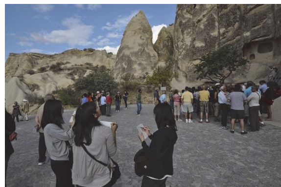
Göreme Open Air Museum in Cappadocia