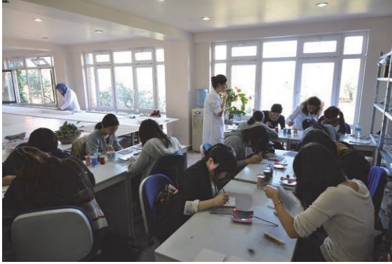
Students practicing Iznik tile painting

We first visited the Iznik Foundation. After observing its kiln and laboratory, we learned about the manufacturing process of ceramics before drawing on 12-cm-square tiles. In the afternoon, we visited a small town called Sölöz to observe and sketch a four-storied wooden building. After that, we observed Cumalıkızık, a traditional settlement with 700 years' history. We walked around the settlement and sketched the maze-like streets. Then we returned to Istanbul.