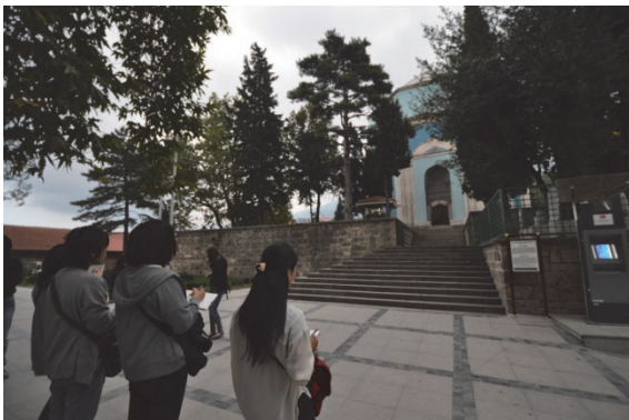
Yeşil Türbe (literally 'green tomb'), a mausoleum from the Ottoman Empire Period.