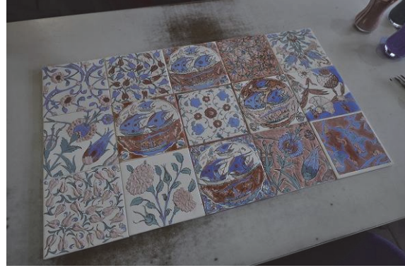
Iznik tiles painted by students