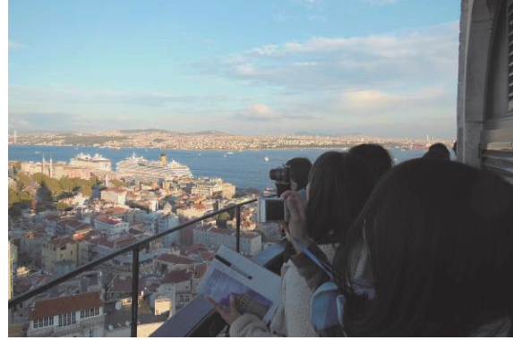
View from Galata Tower