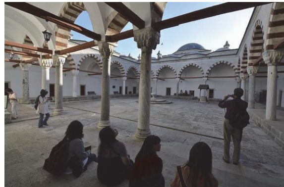
Bayezid II Külliye Health Museum: characterized by its space for music therapy