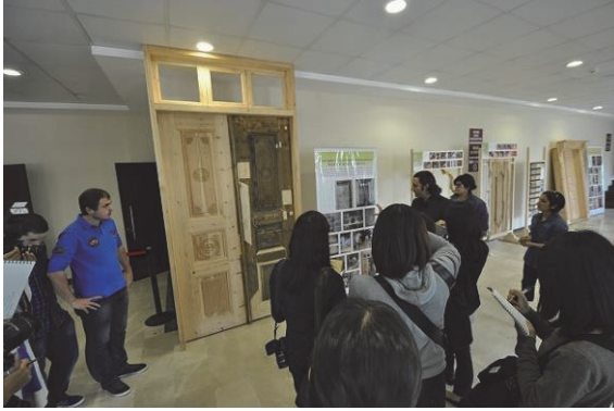
Wooden door renovated by KUDEB (Directorate for the Inspection of Conservation Implementations)