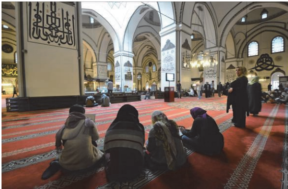
Ulu Cami in Bursa

We went to Bursa and visited Ulu Cami, Koza Hanı (silk market) and Yeşil Türbe (green tomb) where which the body of Mehmed I rests. In the evening, we had dinner at the house of a student who participated ICOSA in Japan 2012.