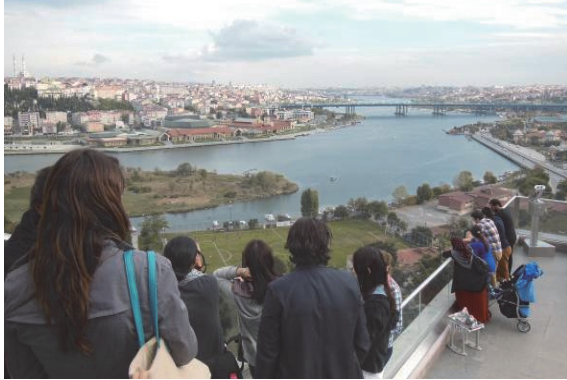
View from Pierre Loti