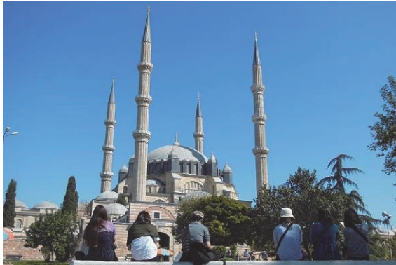
Selimiye Mosque: designed by Mimar Sinan in late 16th century and considered his masterpiece

We visited Edirne, which is near the borders with Greece and Bulgaria. Edirne supposedly originated in a town constructed by Emperor Hadrian. The town, called Adrianopolis or Adrianople, used to be the capital of the Ottoman Empire. We visited the Selimiye Mosque, which was designed by Sinan, a great Ottoman architect; Sinan himself considered this mosque his magnum opus. We also visited Eski Cami (Edirne's oldest mosque), Uç Serefeli Mosque whose four minarets are all different in form, and the Bayezid II Külliye Health Museum, which is characterized by its space for music therapy.