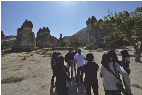
Paşabağ (Monks Valley) in Cappadocia

First, we visited and sketched a seminary and a church in a town called Mustafapaşa that was previously inhabited by the Greeks and now features mixed styles of houses from the Roman period. Then at Paşabağ, we observed a famous mushroom-shaped rock that resembles a camel and a cave hotel and sketched them. In the afternoon, we visited Yassihöyük, where the Japanese Institute of Anatolian Archaeology (JIAA) is conducting excavations. Yassihöyük is 500 m north-south, 625 m east-west, and is 13 m high. Then we visited JIAA in Kaman, attended a meeting, had dinner, and spent the night at the institute.