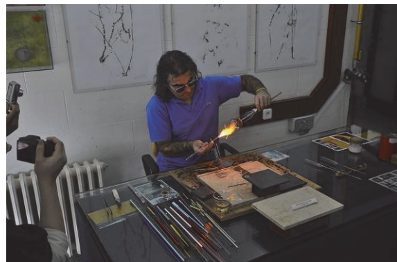
Demonstration of glass sculpture at Glass Furnace