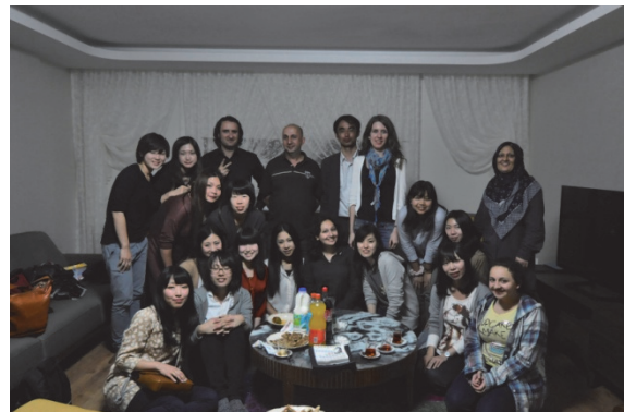
Commemorative photo with the BU students' family