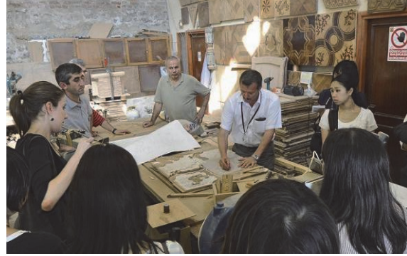
Renovating wooden floor of palace