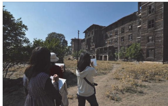
Greek Orphanage: Turkey's largest wooden building