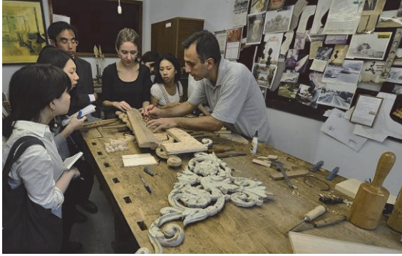
Making and renovating woodcarvings at the atelier in Yıldız Palace