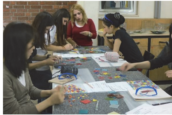
Students making glass sculptures using a technique called fuzyon