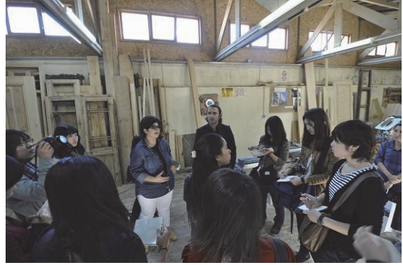
Student studying at KUDEB laboratory