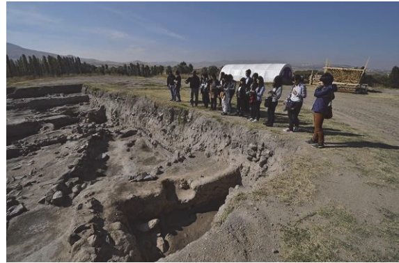
Kaman-Kalehöyük: excavations conducted by JIAA