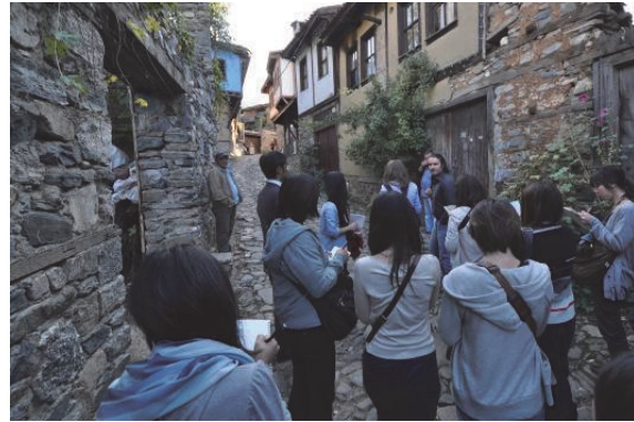
Cumalıkızık: traditional settlement with 700-year history