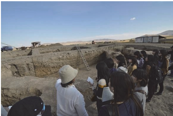
Yassihöyük: conducted excavations by JIAA