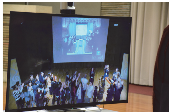
Closing ceremony: The participants from Turkey and Japan celebrated the closing of the successful conference via video.