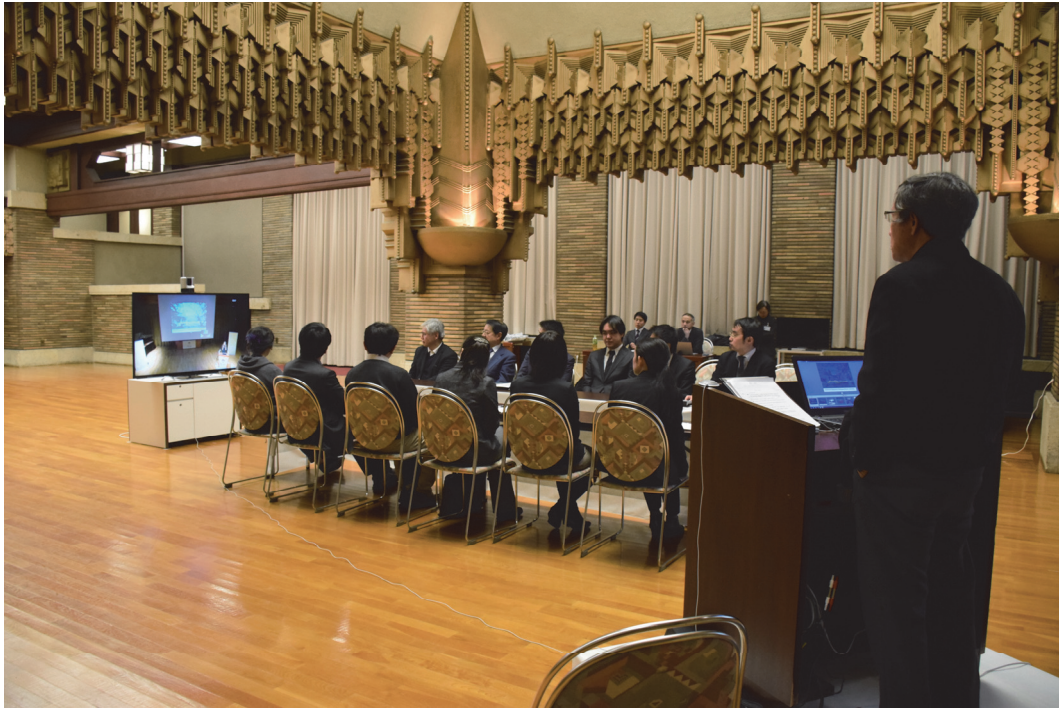
Teachers participating in the opening ceremony from the West Hall of Koshien Hall using a video conferencing system.