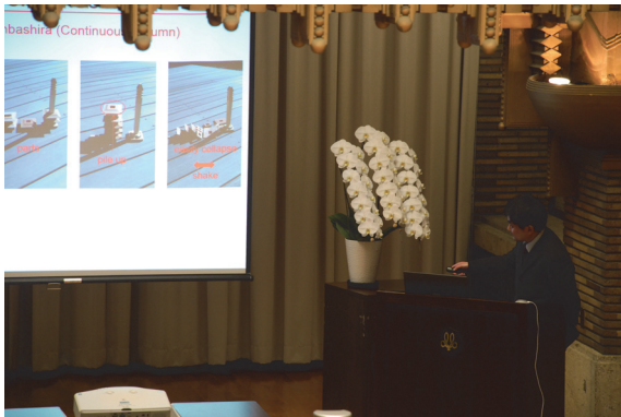
Presentation by researcher of ITCS, MWU