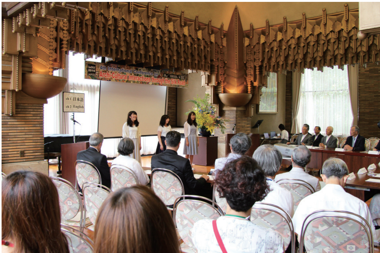
Opening: Chorus Performance by MWU Students

During the lunch break, a welcome party was held in Koshien Hall. Researchers from around the world gathered and interacted with each other.