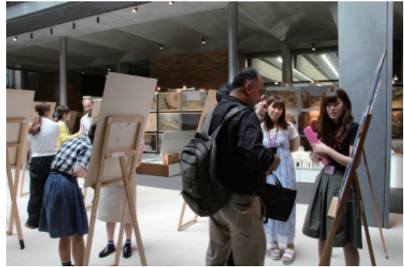
Poster Session by MWU Students