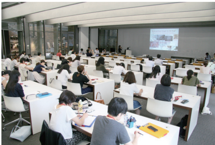
Session at East Studio in Architecture Studio