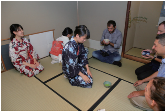
Third-year architecture students voluntarily performed the Japanese tea ceremony

In the tea room on the campus, the third-year architecture students voluntarily performed the Japanese tea ceremony, which many overseas researchers were able to experience. A poster session of works by architectural students was also carried out. In addition, the graduate students in architecture exhibited works of architectural origami and mosaic paintings. Exhibition of design projects by Mukogawa Women's University architecture faculty members, including Naruo Station, Bamiyan Cultural Centre, Petra Museum, and the Hisham's Palace project, were also presented.