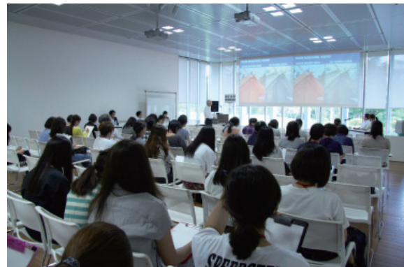
Session at Presentation Room in Architecture Studio