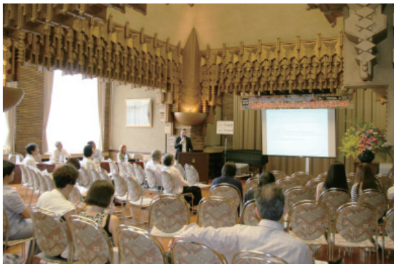
Session at West Hall in Koshien Hall