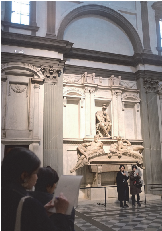
New Sacristy in the Basilica of San Lorenzo