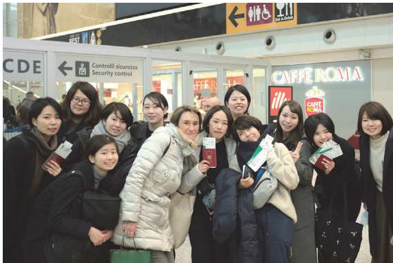
Photo with a tour guide in Rome, Fiumicino Airport

After flying for 13 hours (with an intermediate stop at Amsterdam Airport Schiphol), all members arrived at Kansai International Airport in the morning of March 2, 2019. The ICSA program in Rome became a precious cultural experience for the students. This experience will certainly be useful in their future careers.