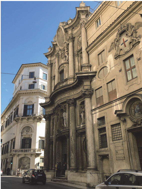
San Carlo alle Quattro Fontane

At our last stop, we visited Viale Appio Claudio, an ancient Roman aqueduct. There, we learned about the water supply in the ancient Roman age and the structure of the aqueduct.