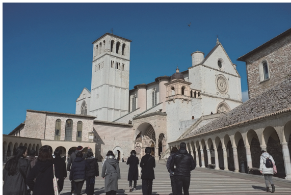
Basilica of San Francesco, Assisi

We traveled to the north of Rome on a tour to Assisi and Siena. The Basilica of San Francesco of Assisi has been a UNESCO World Heritage Site since 2000. This basilica is the mother church of the Roman Catholic Order of Friars Minor Conventual. It is also one of the most important places of Christian pilgrimages in Italy. The upper church of the basilica exhibits a Gothic architecture, whereas the lower church follows the Romanesque architecture. After having lunch at Assisi, we moved to Siena. Siena was listed as a World Heritage Site in the year 1995. We enjoyed the middle-ages cityscape of Siena and we visited Duomo di Siena and Piazza del Campo. It is said that Duomo di Siena has the most beautiful Gothic façade in Italy. After visiting Siena, we departed to Florence.