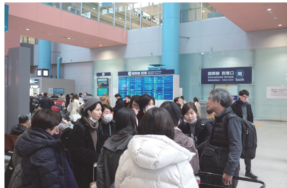
Kansai International Airport