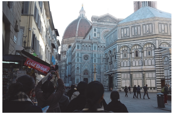
Santa Maria del Fiore