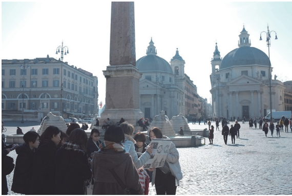
Piazza del Popolo

After lunch, we visited San Pietro in Montorio Tempietto designed by Donato Bramante in the 16 th century. Tempietto is known to be one of the greatest works of the High Renaissance architecture. Tempietto became a template for later cupolas. In the evening, we visited Santa Maria della Vittoria. This Roman Catholic church is known for its famous sculpture, namely, the Ecstasy of Saint Teresa, completed by Bernini. We had an opportunity to see the wonderful combination of the architecture and its sculptures. At our last stop of the day, we visited Santa Maria degli Angeli. This chapel was a Roman bath built in the Renaissance period originally. Michelangelo redesigned the chapel and informed it into a church.