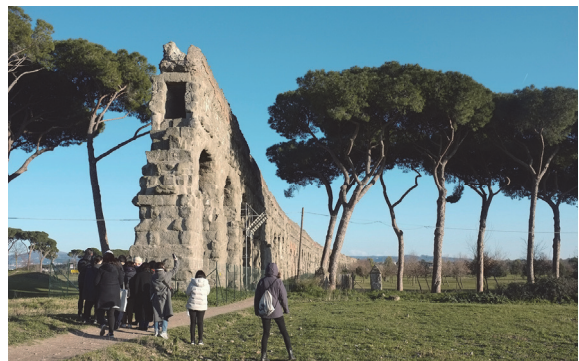
Viale Appio Claudio