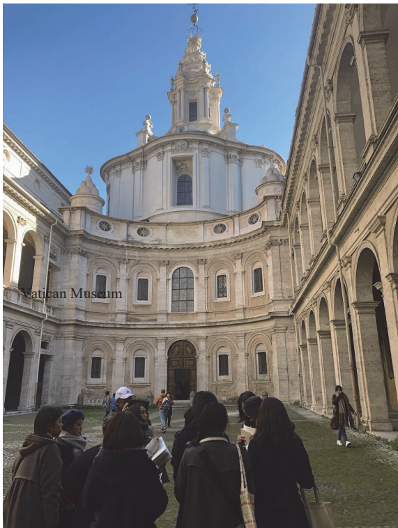
Chiesa di Sant'Ivo alla Sapienza

We toured around several sites to learn about the Renaissance and Baroque architecture. First, we visited the Campidoglio designed by Michelangelo. Later, we stopped at Chiesa di Sant'Ivo alla Sapienza designed by Borromini to admire his great masterpiece. Afterwards, the students sketched both the interior and the exterior of Chiesa di Sant'Ivo alla Sapienza. Then, we moved to the cafeteria nearby, where we had a light meal. After lunch, we visited Borghese Gallery to learn about the Baroque sculpture completed by Bernini. There, we had the opportunity to admire some famous sculptures, such as Apollo and Daphne, the Rape of Proserpina, and David. Next, we stopped at Porta Pia, whose façade was designed by Michelangelo. Afterwards, we went to San Paolo fuori le Mura, one of the four papal basilicas of Rome. At the basilica, we learned about the spatial composition of the early Christian architecture. Finally, we moved to Trajan's Markets, an ancient Roman building complex consisting of offices, stores, and houses, among others. This building complex was constructed using Roman concrete in the 2 nd century AD. There, we were able to see the construction of ancient arches in the Roman era. February 24 was the last day of our tour in Rome.