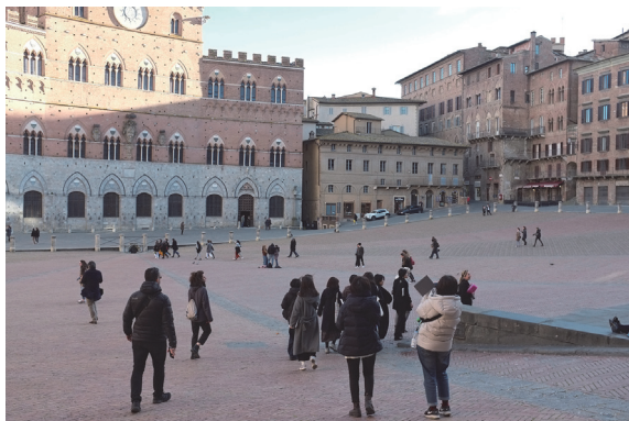
Piazza del Campo, Siena