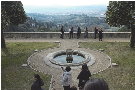
Villa Medici a Fiesole

drugstore in the world, with a façade designed by Alberti. The students observed the façade carefully and sketched it.