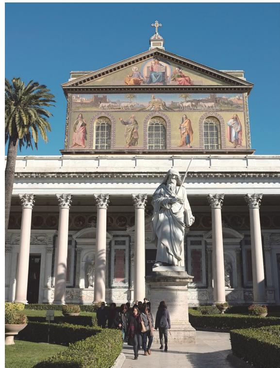
San Paolo fuori le Mura