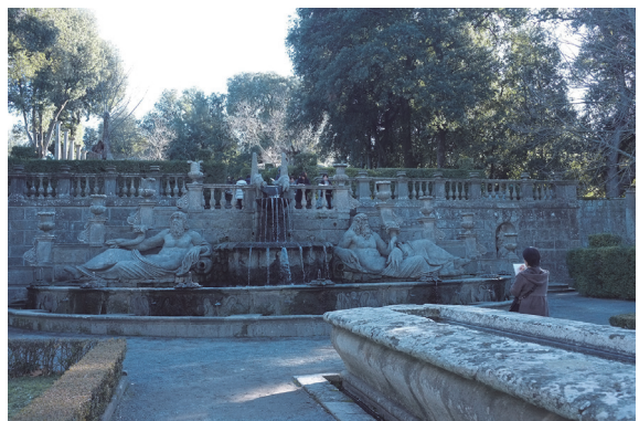
Villa Lante: Fontana dei Giganti