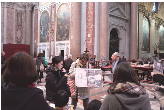
Santa Maria degli Angeli