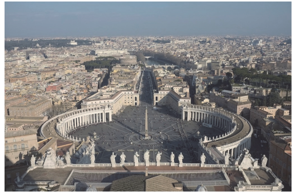
Piazza San Pietro