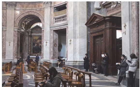
Saint Andrew's at the Quirinal