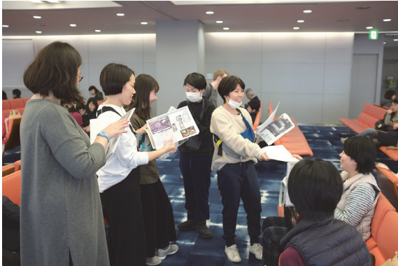
At Kansai International Airport, The exchange program students are distributing their report on visiting historic places.