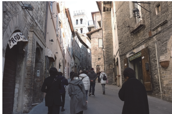
Middle-ages cityscape of Assisi