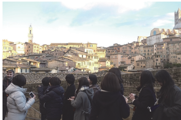
Middle-ages cityscape lit up by the setting sun, Siena