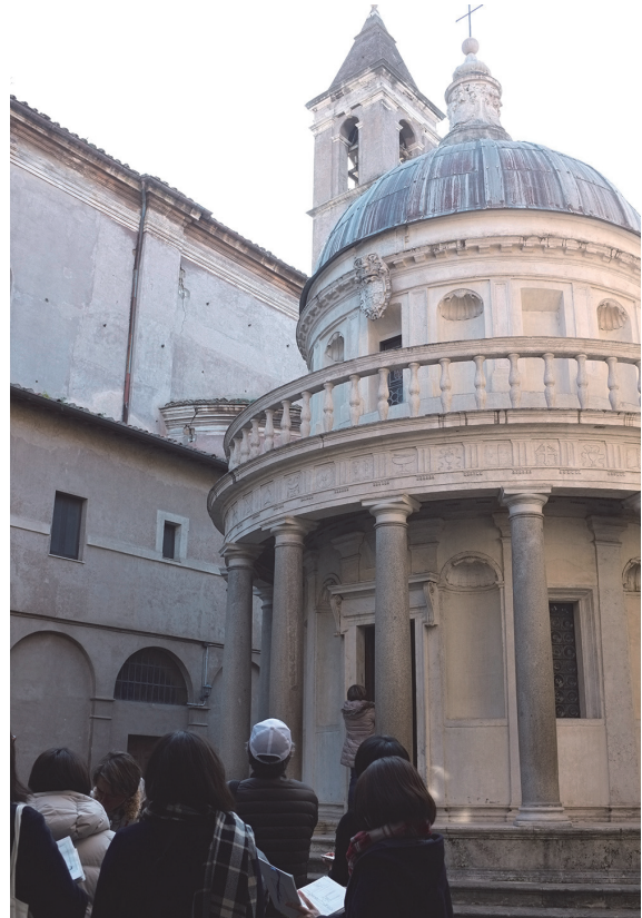
San Pietro in Montorio Tempietto