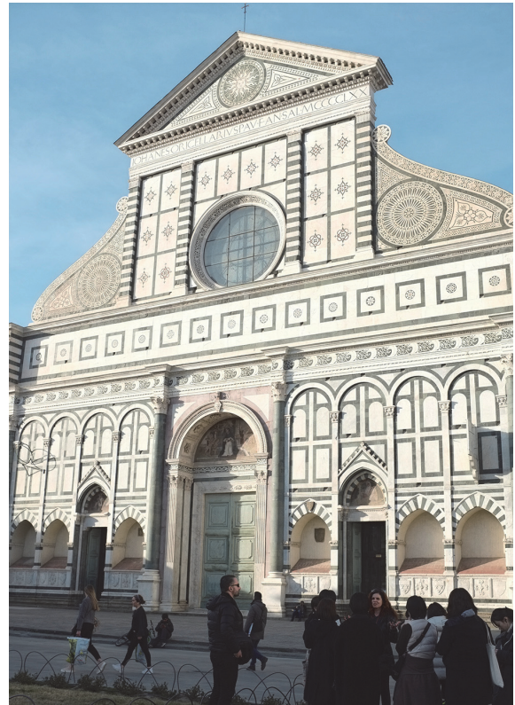
Basilica di Santa Maria Novella